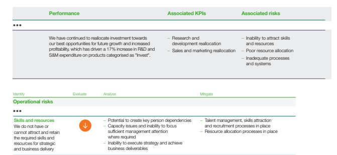
Figure 5.4 Illustration on how information on risks related to intangibles is currently provided