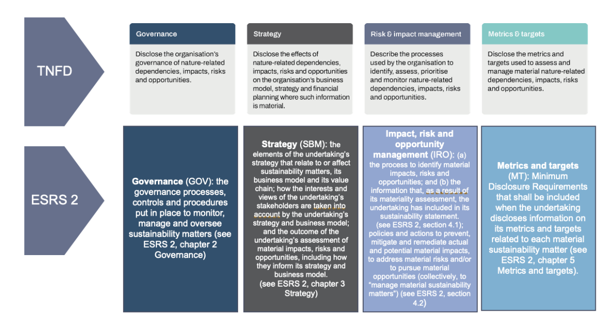
Figure 3: Both the TNFD and CSRD have followed the TCFD's four pillars with adaptation to enable double materiality

These four pillars or reporting areas were originally identified by the TCFD (which calls the third pillar 'Risk management') and are also embedded into other standards such as the IFRS sustainability standards S1 and S2.